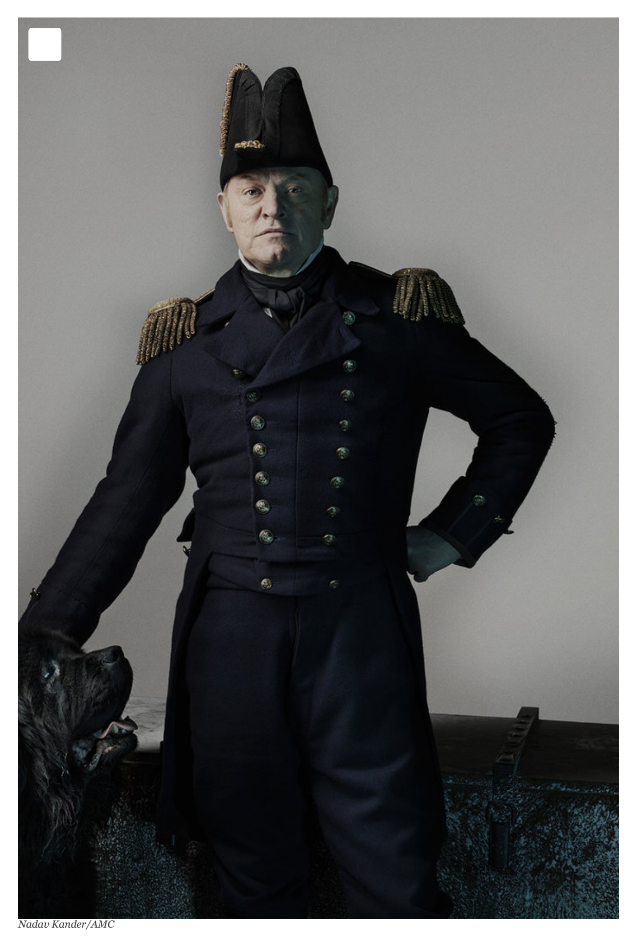
The cast is male heavy but there was no time for lads on tour antics...